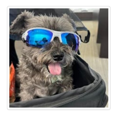
Panzy Money July 26, 2024

Panzy was as great a companion as you could imagine and loved to travel. Thanks to God for sending that wonderful little creature our way and it is with much gratitude that we say au revoir to the little heart stealer. She was a rescue and the best dog we have had. We celebrated her 13th birthday on July 4th and I had her for 12 years and 4 1/2 months. She was more than a dog to us and she had the whole package - looks and personality. I will miss strangers coming up to us, taking on over her, and asking if they could pet her - something that she totally enjoyed and always obliged and never tired of. I strongly believe that dogs are here to teach us unconditional love and to remind us that time is fleeting. Panzy did that in a spectacular manner.